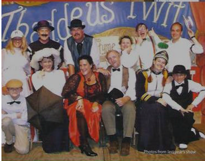
Photos from last year's show