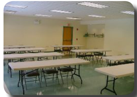
Historical Room with Kitchenette (Capacity 40)