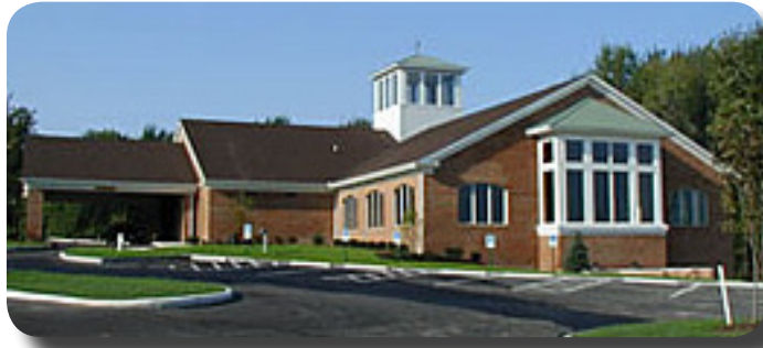
O’Ryan Room with Kitchen (Capacity 160)