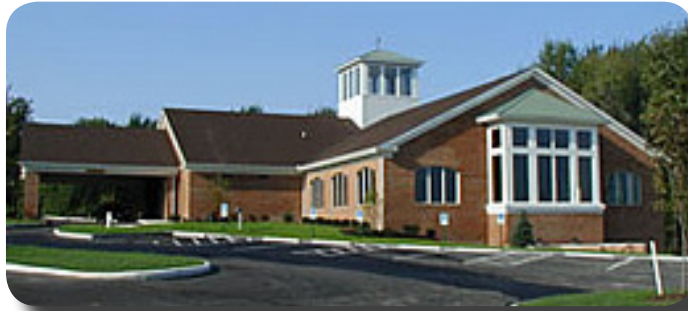
O’Ryan Room with Kitchen (Capacity 160)